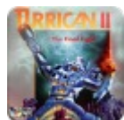
Turrigan II : The Final Fight