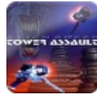
Alien Breed Tower Assault