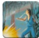
Assassin Special Edition