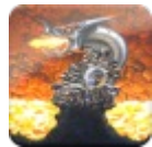
Project-X Special Edition