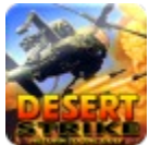
Desert Strike: Return to the Gulf

After reading the above article, my curiosity got the better of me and I checked the Blackberry app store ( appworld.blackberry.com ) to see what games were actually available. The listing below is the current list of Amiga games as of this writing (March 28, 2013).