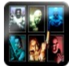
The Chaos Engine