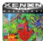
Xenon 2 : Megablast