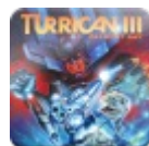
Turrigan III : Payment Day