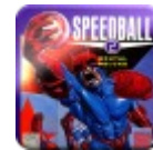
Speedball 2: Brutal Deluxe