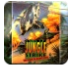
Jungle Strike: The Sequel to Desert Strike