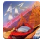
All Terrain Racing